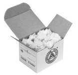
Mineral Fiber Filler "Asbestos-Free"